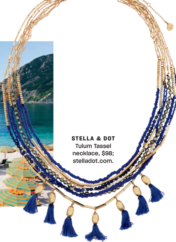
STELLA & DOT Tulum Tassel necklace, $98; stelladot.com.